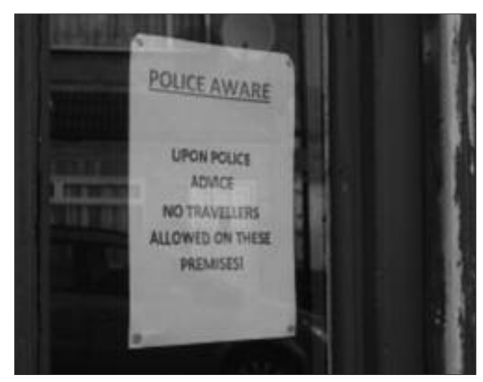
This sign at a pub in Walthamstow in 2012 was reported to police and removed 3 days later, as it is illegal.