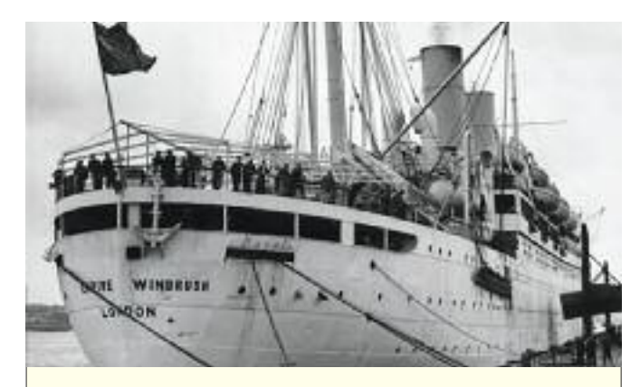
The Empire Windrush arrives from the Caribbean in 1948